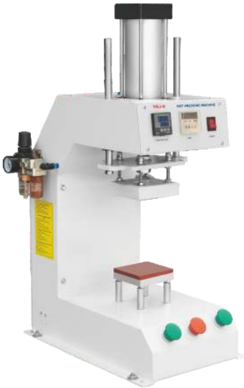
OP-H8 气动商标热压机 Pneumatic brand heat press machine