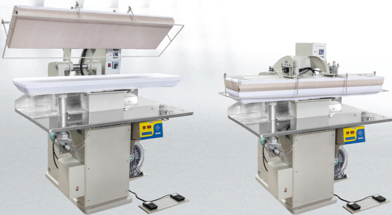
DJT-WB 电脑万能夹机 Computer Universla Press

DJT-MA蒸烫机主要用于毛、棉、合成纤维、混纺织物等不同面料服装在制作过程中的熨烫和服装加工完成的定形。本机分为电脑蒸烫、免烫二种。该系列根据烫模的大小不同可分为大模烫机、小模烫机及立领机三种型号。每种型号内又根据形状不同形式的烫机以适用于服装不同部位的熨烫定形。